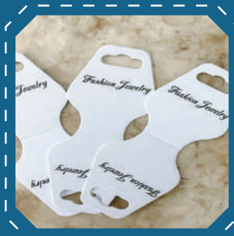
Full Cut 350 GSM

+91 93243 76523 | +91 93243 63933 | +91 80978 08799